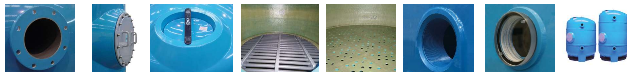
Flanged connections Plastized Manhole lid GRP Elliptical manhole lid Support for rings G415-G960 Support for rings G1010-G2550 Threaded connections Optional sightglass Customizable height