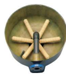
Optional Arms collector 0.2/0.5 mm