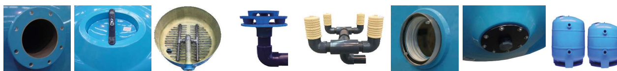
Flanged connections GRP Elliptical manhole lid Arms collector 0.3 mm Diffuser for Sand / AFM Diffuser for Ionic Exchange Optional sightglass Emptying access Customizable height